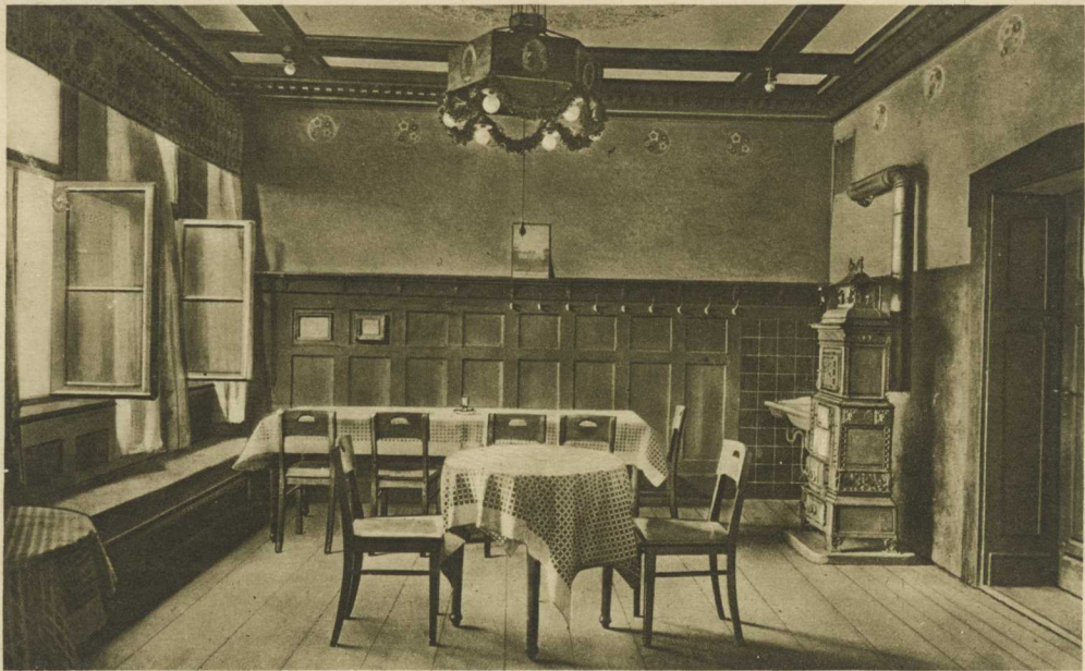
Restaurant Jörn Müller, Cassel, Wolfangerstrasse 17.